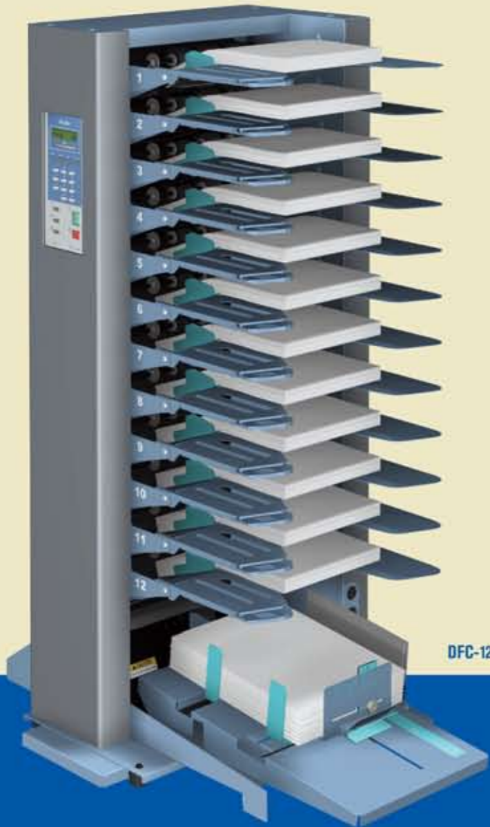
DFC-120 friction collating tower

The vertically arranged DFC-series collators are available in 10, 12, 20 or 24 station configurations with an output speed of up to 4,200 sets/hour. On-the-run loading and bi-directional feeding enables productivity to be maintained whilst simply collating or sending sets to the online bookletmaker.